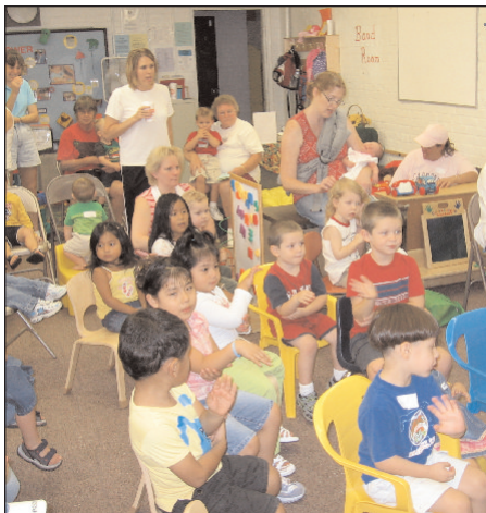
PFRN families enjoying story time at Playgroup

The Plainville Community Schools' Family Resource Network (PFRN) is a school, family, and community partnership working together to help children grow and acquire literacy skills. This program is funded through a Connecticut State Department of Education grant, school district in-kind support, and other state, local, and private-sector grants. "One of the most rewarding